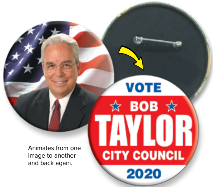
Animates from one image to another and back again.

Lenticular plastic is affixed to a metal shell with a plastic backing and a full standard safety pin attachment.