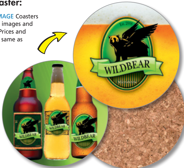
Cork Back (29 mil.)

FLIP IMAGE Lenticular Coasters feature two images that "flip" from one image to another – and back again.